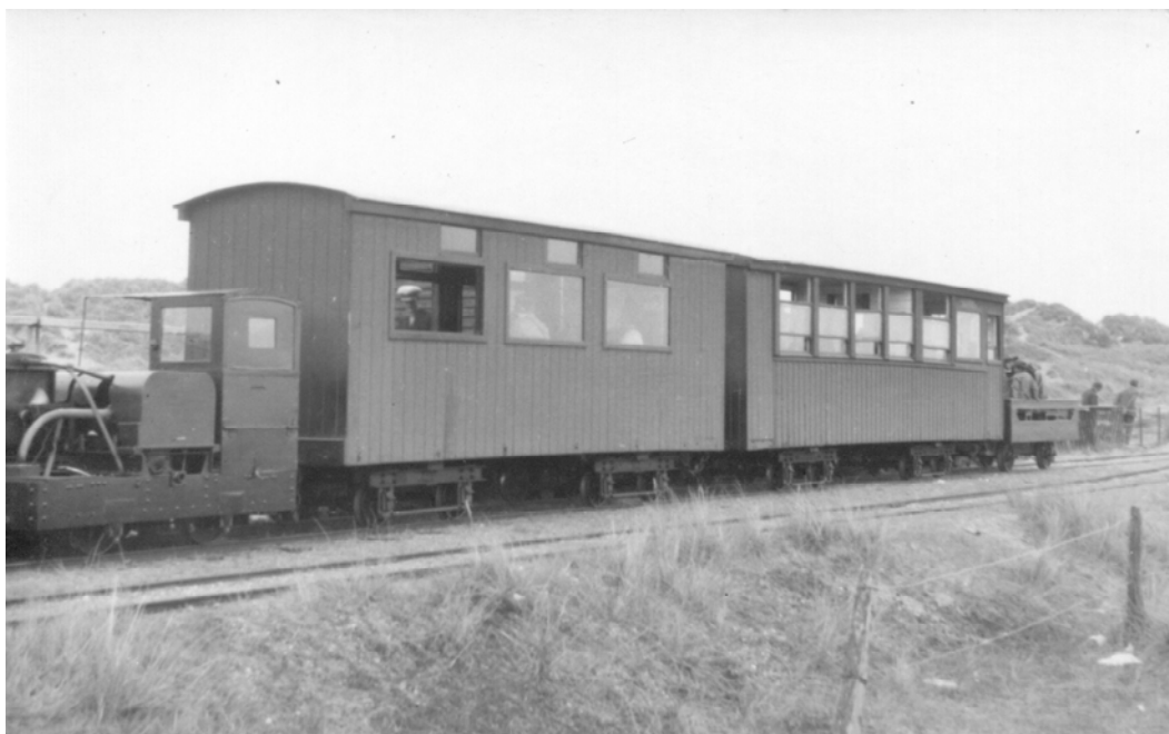
The Rother Ironworks coach (nearest the Kent Construction petrol tractor) as modelled in this kit.